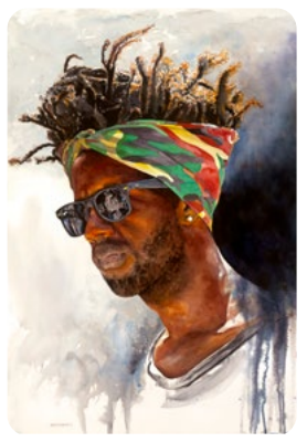
"Modern Man" by Tony Armendariz

In 2020, Armendariz painted "Modern Man," another watercolor inspired by a Black man. The artist copies the tightly wound expression on the man's