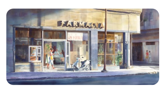
"Havana Pharmacy" by Tony Armendariz

In 2020, Armendariz painted "Modern Man," another watercolor inspired by a Black man. The artist copies the tightly wound expression on the man's